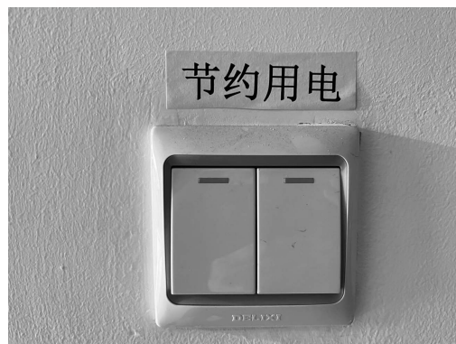
Energy saving slogans in the office